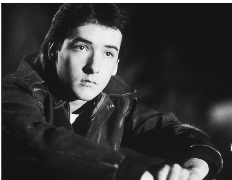
John Cusack is the moody, jacket-wearing star of the '80s film "The Sure Thing."